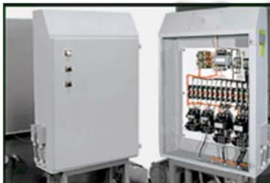
Optional system control console.