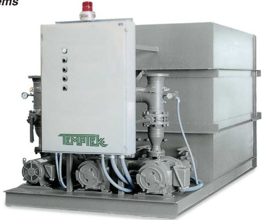
PT-750 shown with 3 pump manifold (process, reciprocation and standby). Model shown complete with the following options: valves mounted with discharge manifold, alarm beacon and prewired system cabinet.