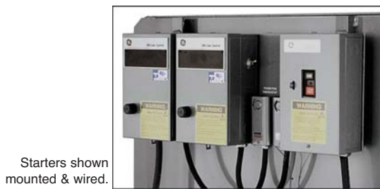
Starters shown mounted & wired.

Starters, valves, and thermostats are supplied as components and shipped loose for field installation with drawings supplied to ease installation. Items can be sold as components to allow customizing systems to customer requirements. Also this makes changes to existing systems a simple process.