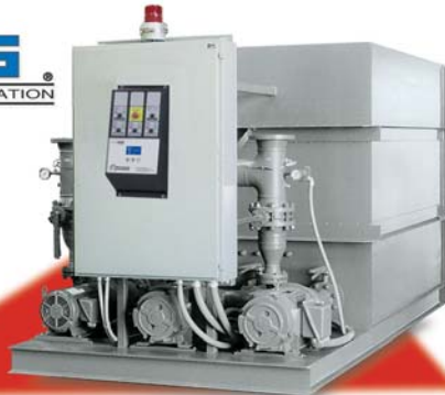
PTS-2000, 2000 gallon epoxy coated steel pump tank system

POLYETHYLENE RESERVOIRS, TOUGH TANK™ , are a patented hybrid design that creates a structurally sound cylindrical reservoir that provides total corrosion resistance. Polyethylene reservoirs are used in both tower and chiller systems. Each system is customized by our design engineers to include the proper reservoir size, flow, pump pressure and desired options.