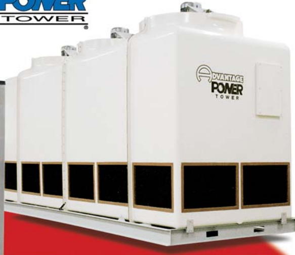
TC-405F: 405 ton fiberglass tower cell

ADVANTAGE Tower Cells cool process water by evaporating a small portion of the recirculated water in the cooling system. Ambient air temperature and humidity influences the achievable water temperature. At design conditions, 85°F water can be provided. Tower cells are a part of a central cooling system and are installed outside, generally either elevated on a stand or mounted on a roof. Available capacities range from 10 to 1000 tons in both fiberglass and galvanized steel construction.