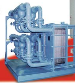
MLS-4: full flow filter