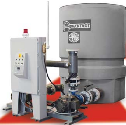
TTK-1500: 1500 gallon rotational molded pump tank system, shown in conventional configuration.