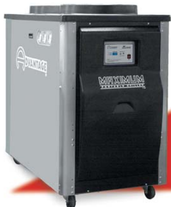
MK-10A: 10 ton air-cooled portable chiller with M1 instrument