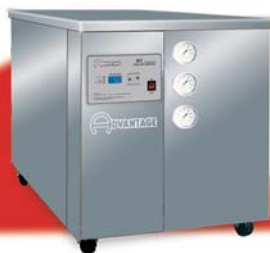
MK-2A: 2 ton air-cooled portable chiller with M1 instrument