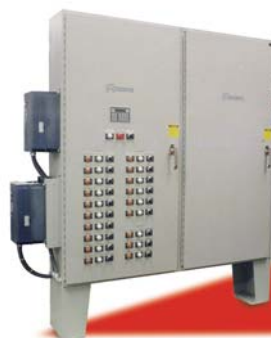
Control Station with individual operators for a custom 800 ton central chilling and tower system.

ADVANTAGE supplies many products to compliment standard heat transfer system products. These include Filters, Pump Stations, Heat Exchangers, and Control Cabinets. ADVANTAGE System engineers design individual components and complete systems.