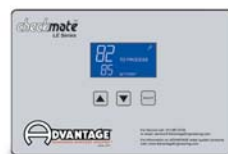
Optional Control & Monitoring Instrument

PUMPING SYSTEMS are part of ADVANTAGE Pump Tank Stations . Heavy-duty centrifugal pumps specifically selected for the application provide the required flow and pressure to each use point in the system. Systems are configured with process pump or process and recirculating pump with optional standby. Systems can be equipped with full electrical starting, monitoring and diagnostic components including variable speed drive systems that maintain constant fluid flow and pressure.