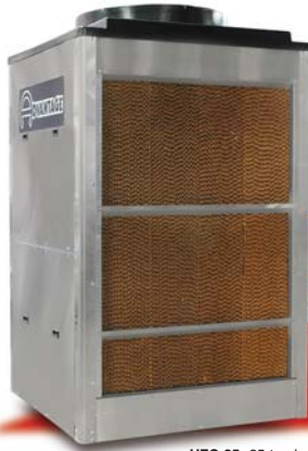
HFC-25: 25 ton hybrid fluid cooler