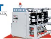
Indoor multi circuit water-cooled chilling module