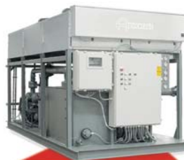
Outdoor air-cooled chiller with integral reservoir and pumping system