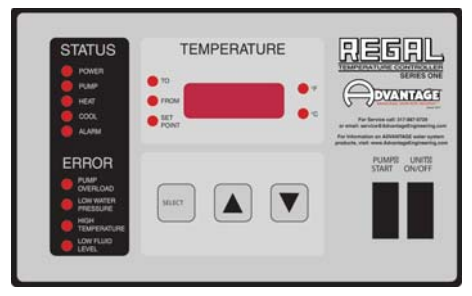
500°F REGAL LE