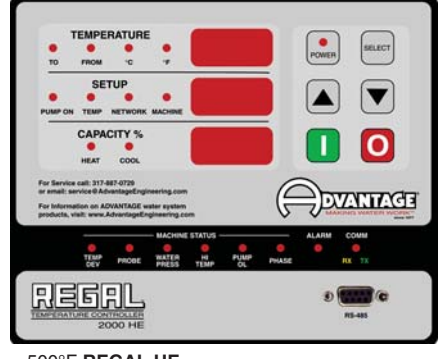
500°F REGAL HE