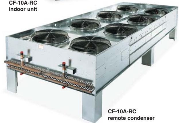
CF-10A-RC remote condenser