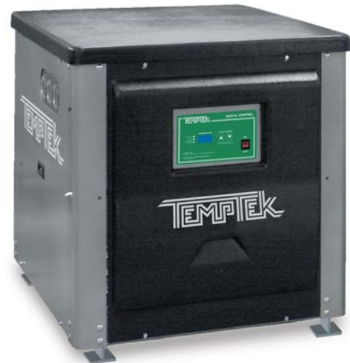
CF-10A-RC indoor unit