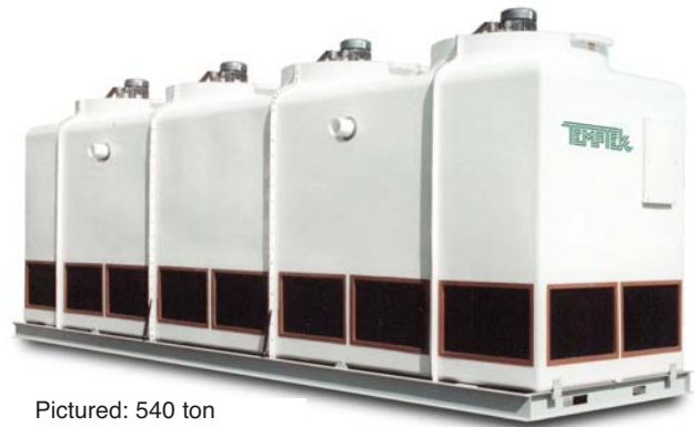
Pictured: 540 ton TP Series cooling tower

PRICE & PERFORMANCE... for the LONG TERM