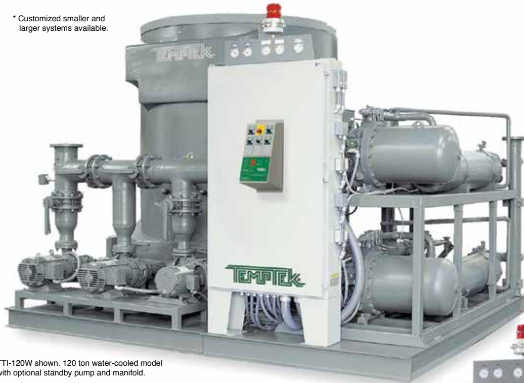
TTI-120W shown. 120 ton water-cooled model with optional standby pump and manifold.