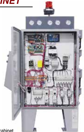
Typical electrical cabinet

* Water condensed only. Air condensed remote condensers require separate power.