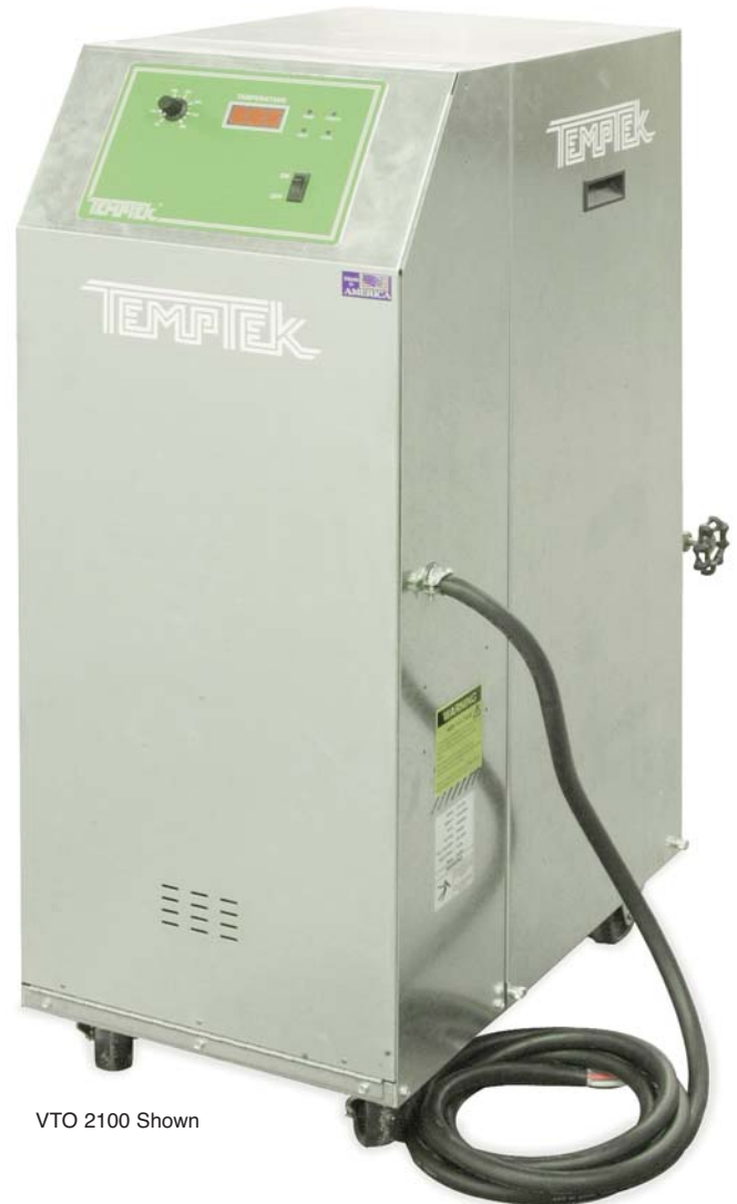
VTO 2100 Shown